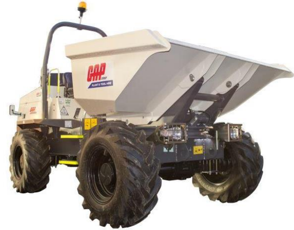
Eco Site Dumpers