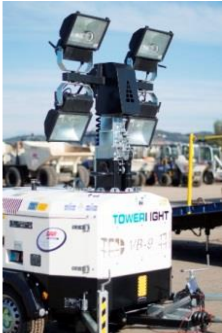
VB-9 Lighting Tower