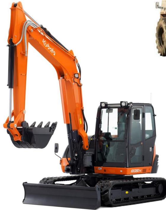
8.0t Kubota Excavator KX080-4