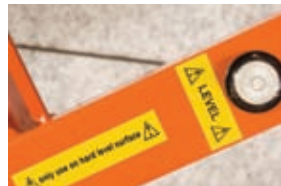
Tilt sensor enables you to check you're on a flat, level surface