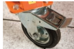
Lockable Castor wheels