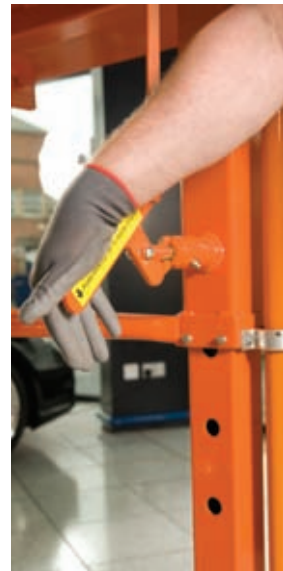
Platform can be placed in a number of positions to reach the ideal working level