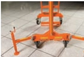
Two outriggers can be deployed quickly - can be positioned for access against walled areas