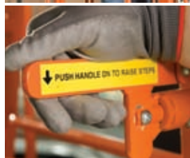
The Quick Step is simple to operate – push the handle at base to gain desired height (pictured bottom), press handle from within platform to lower (pictured top)