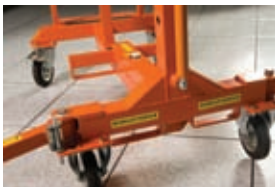
Fork lift points if required to move across site