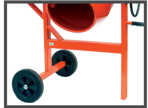
HEAVY DUTY STAND