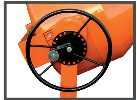
WHEEL MECHANISM FOR ADDED CONTROL