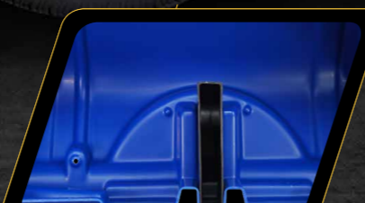
10mm Thick & Baffled Tank