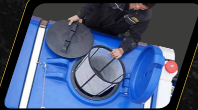
Lockable Hinged Tank Lid with removable Basket Filter