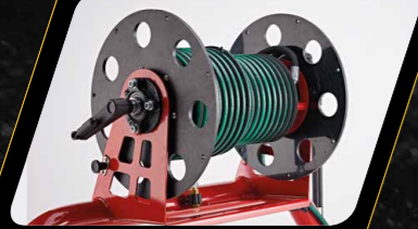
Optional Extra: Manual or 12V DC Electric Hose Reels for 30M - 100M of HP Hose