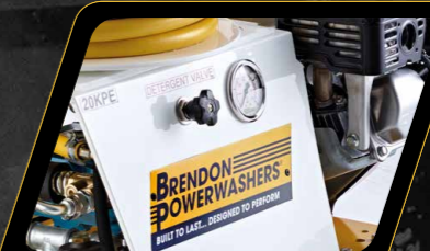
Polypropylene Canopy with Detergent Control Valve and Pressure Gauge