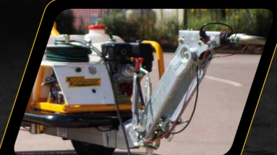
Choice of 50mm Ball or Eye couplings - Alko Adjustable Hitch available