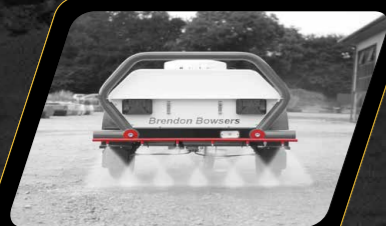
Optional Extra: Rear mounted spray bar for dust suppression