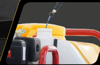
Integral Anti-Freeze & Detergent Tanks