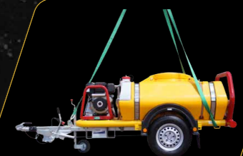
3 Point Lifting Points