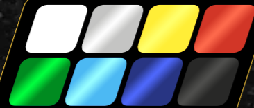
Large choice of Tank & Chassis Colour Combinations