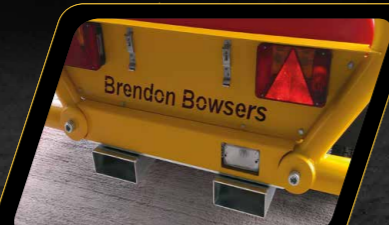
Optional Extra: Rear Forklift Points