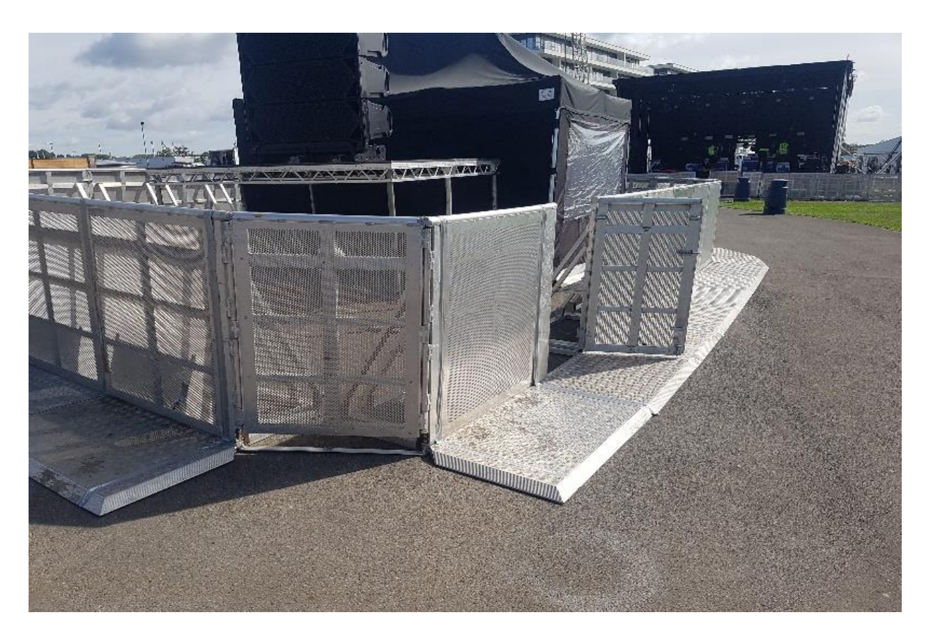
Image showing a 1m front of stage stage/pedestrian gate being used to create access to the front of house area the front of house area has been barrierd all the way round so the gate is the only access creating a secure area.