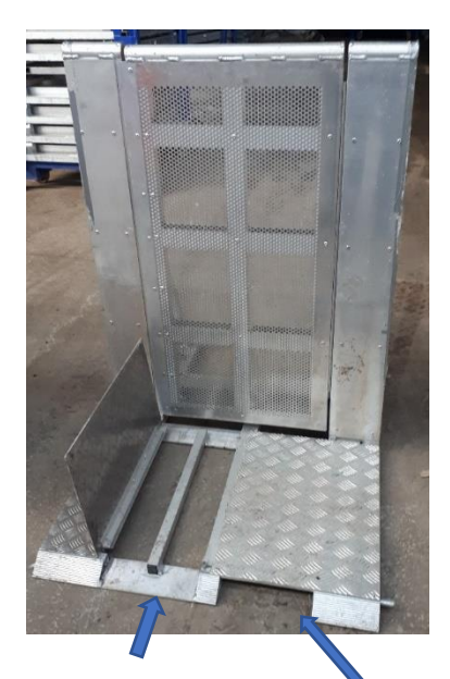
Cables can be layed through the barrier where the flap opens up or the barrier can be place over the cables arrow indicating.