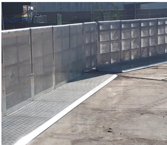
Flexi corner being used to create a slight angle in the barrier line