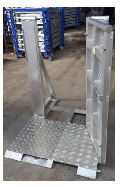
Once the cables have been run through or under the barrier the flap can be closed and the gate can be locked from behind the barrier via a spring-loaded latch.

1m front of stage cable gate barriers (54.9kg) are coded with a green circular sticker the cable gate is a special designed barrier what allows you to pass electrical cables under the barrier or through a specially designed flap what allows you to pass cables through the barrier (pictures as above), cable gate are used in many ways example running cables from front of house to the main stage via cable ramps then passed through the Cable gate barrier (Example pictures below), the same as the 1m front of stage barrier the cable gate barrier has a special location pin on one side of the base plate and a location hole on the opposite side of the barrier what interlock two barrier together, all front of stage barriers must be bolted together at 2 points to secure one front of stage barrier to another (as per image 1m front of stage straight page 1)