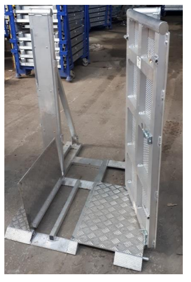
The gate can be opened to make it easier to run cables through for stage crew this also helps when it comes to installation and derig.