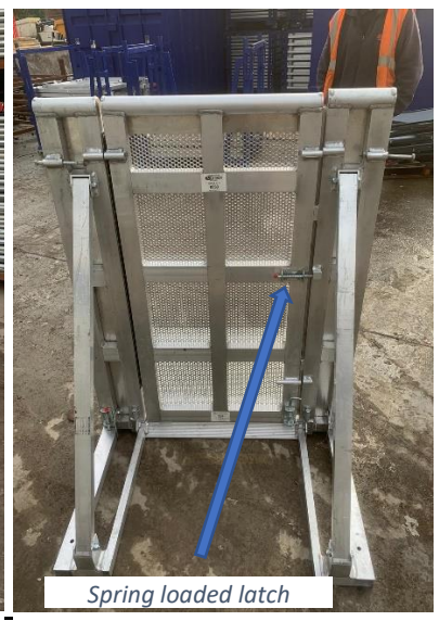
1m Front of stage, stage/pedestrian gate in the closed position showing how the gate continues the streamline continuation of the line of front of stage barriers