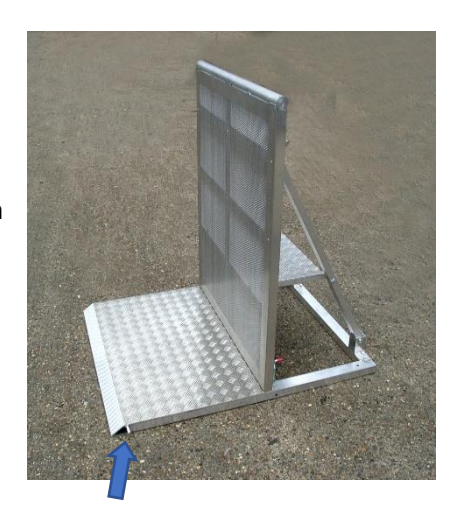
Location pin for interlocking two front of stage barriers together