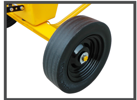
NEW WIDER PROFILE WHEELS FOR EXTRA STABILITY